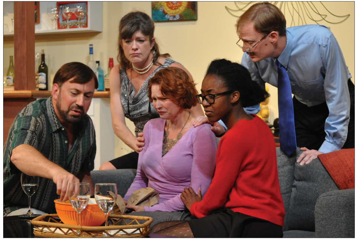
The cast of Key City Public Theatre's production of "The Book Club Play."

environment that is hard to find outside the confines of the university. Our artistic apprentices learn to direct not only by shadowing our directors, but by directing themselves, as recent hit shows Daddy Long Legs and The Book Club Play, both