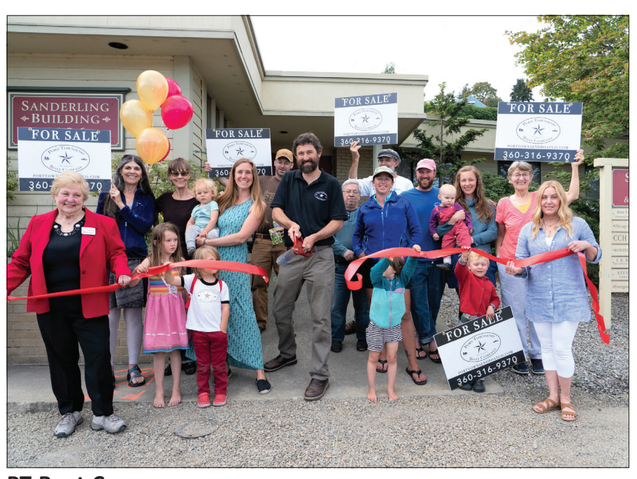
PT Boat Company Chamber Ambassadors welcomed new member Port Townsend Boat Company to the Chamber during a ribbon cutting and grand opening event on June 2 at its location in the Sanderling Building, 1136 Water St., Suite 104, in Port Townsend.